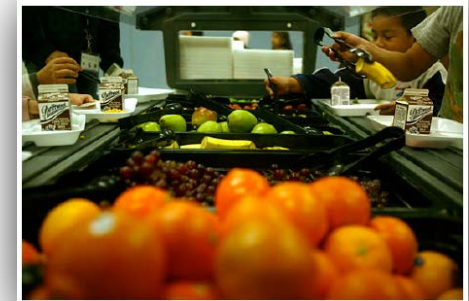
Elementary School Fruit/Vegetable Bar Program