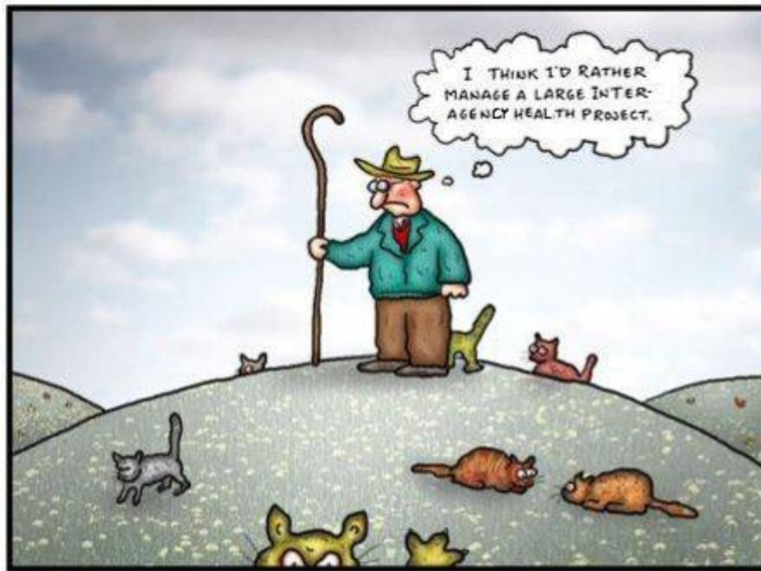
The daydreams of cat herders